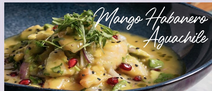
Mango Habanero Aguachile

Two flaky pastries filled with shredded beef and melty oaxaca cheese, served with consommé, white onion and cilantro. 22